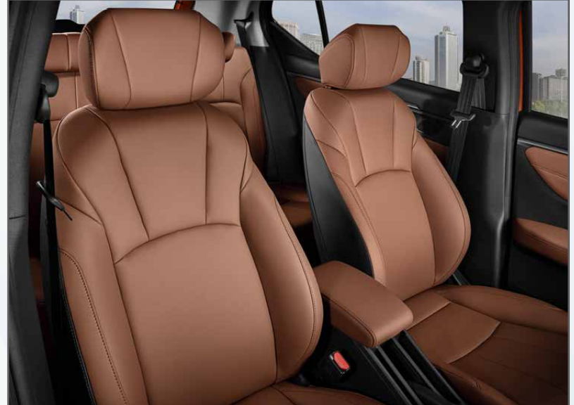
Plush & Comfortable Cabin