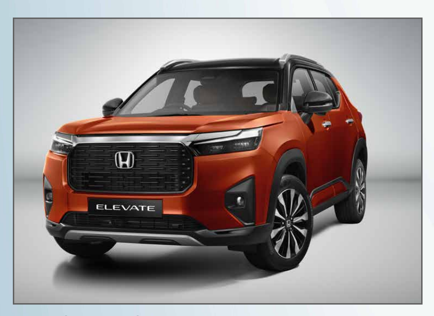
High Ground Clearance