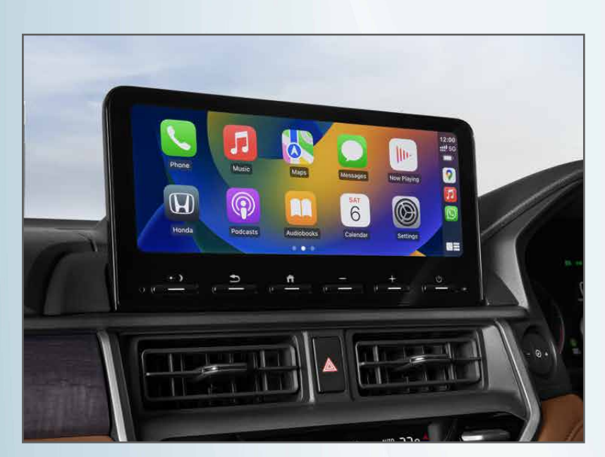
26.03 cm (10.25") HD Touchscreen Display Audio with Wireless Apple CarPlay & Android Auto