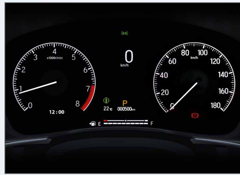
17.7 cm (7") HD Full Colour TFT Meter