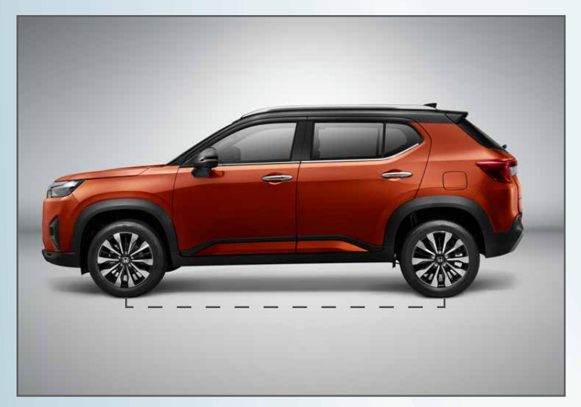
Long Wheelbase (2650 mm)