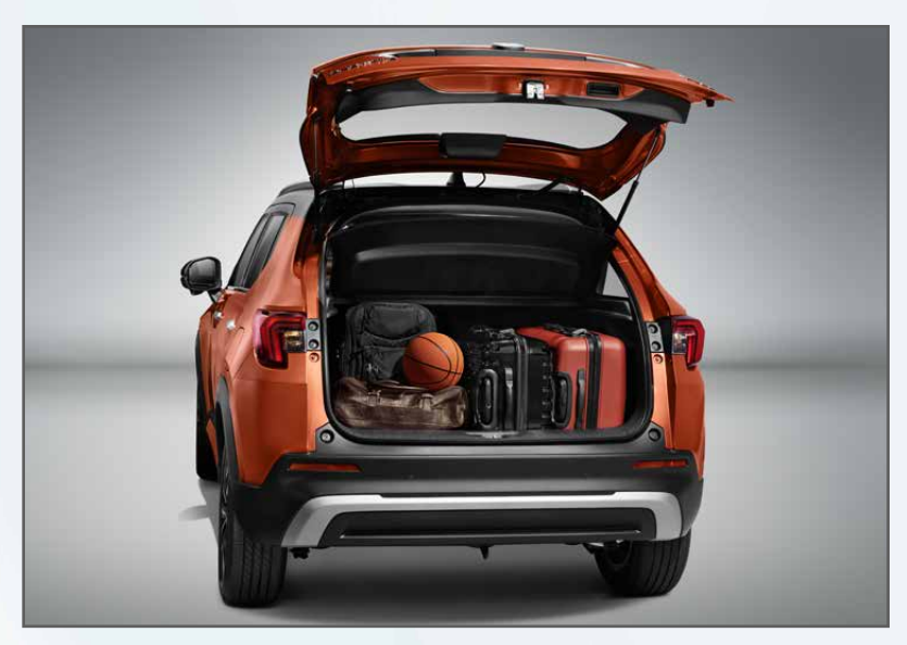
Large Boot Space (458 L) and 60:40 Split/ Foldable Rear Seats