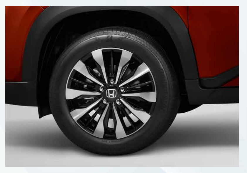
R17 Dual-Tone Diamond-Cut Alloy Wheels