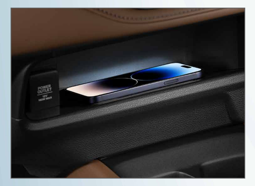
Wireless Smartphone Charger