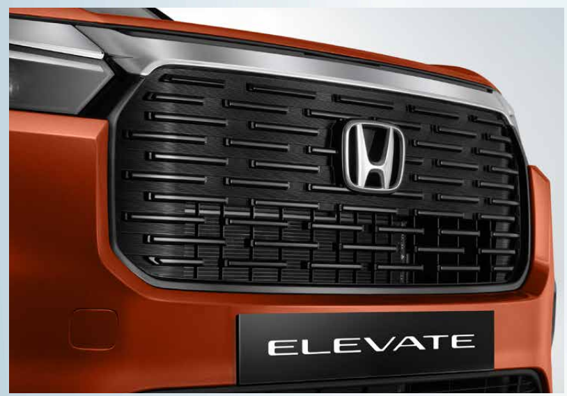
Bold Front Grille