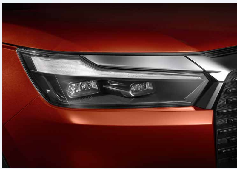
LED Projector Headlamps with LED DRL & Turn Indicators