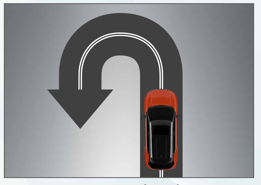
Minimum Turning Radius (5.2 m)